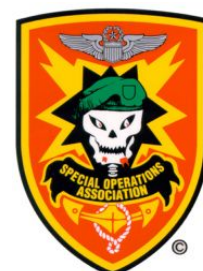
Special Operations Association