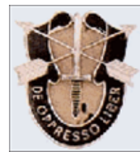
5 th Special Forces Group