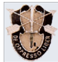
5 th Special Forces Group