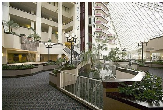
Crowne Plaza Hotel St Louis

AND START YOUR PLANS FOR ST LOUIS 2007 !!