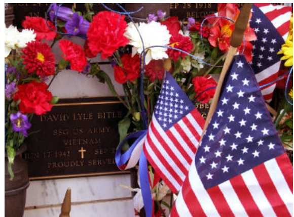
Dave Bittle - The Punchbowl - Memorial Day 2008