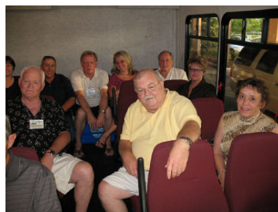
On the bus to good eats..