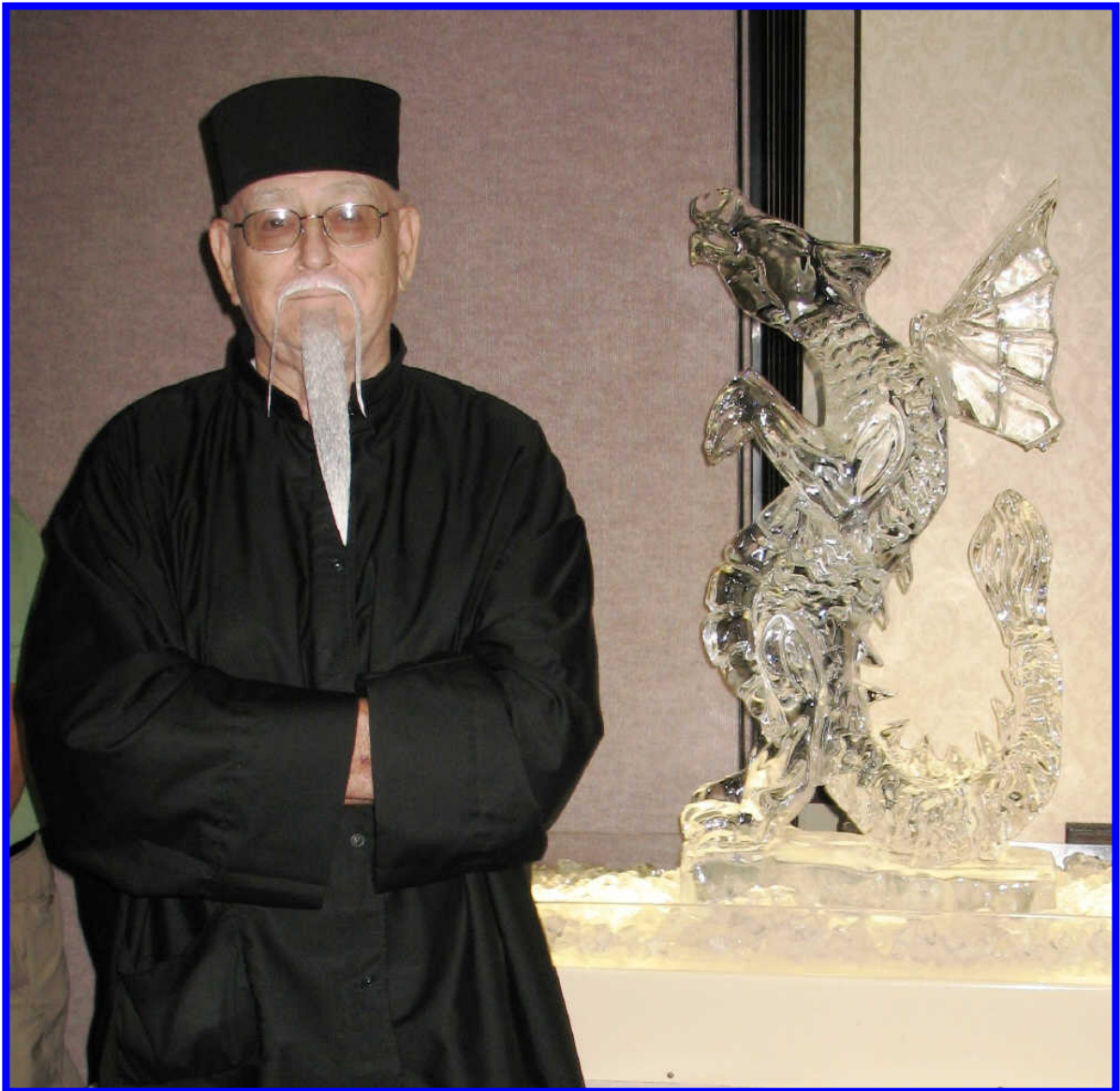
CHOU LEE #1 Laundry Hong Kong

REUNION 2008 "R&R HONG KONG" A FANTASTIC TIME HAD BY ALL!!