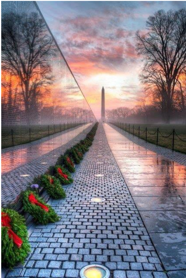
The Wall in Washington, D.C

So, there is a short overview of your 2016 Reunion destination and some suggested spots to visit. Welcome to the Tar Heel State!