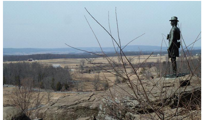
Little Round Top looking northwest

My other job is helping to get Flag Cases to a member's family upon their death. As for me I have been much too busy doing that job for the last few months. If you know when one of us makes that final flight, please make sure Jack Mayhew or myself find out about it. If there is to be some type of service at a later date, we will do our best to make sure the case, and if possible some of our members, make it to the service. It takes a couple of days to get the plaque with the name and case ready to ship to the family, or for a 281st person to deliver it. Stay healthy out there and see you this fall. Frank Becker (febeck2002@yahoo.com).