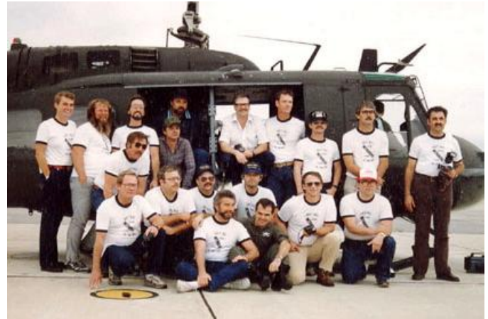
Original reunion in St Louis, 1986