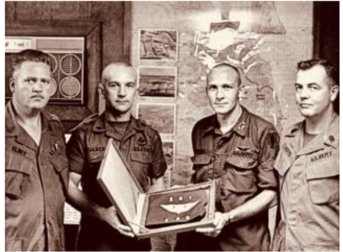
Deactivation of 281st AHC at 10th Bn.