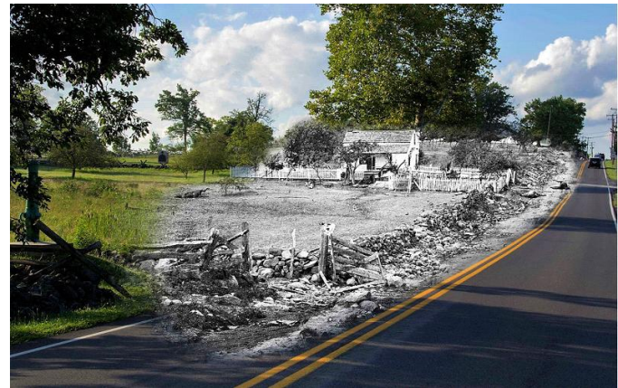
Emmetsburg Road 1863-2013

charge or special licenses. Also, if we elect to hold a function requiring a change of arrangements in the hospitality room, there is no charge to rearrange the room. This motel has hosted multiple military reunions and has a good rapport with the military. Because of the range of local activities available on Saturday, all meetings and special events will be held on Thursday evening and Friday. Thursday evening from 6pm to 10pm, we will have exclusive use of the Gettysburg National Military Park Visitors center and will see the movie, the Cyclorama, and have free access to the museum. We are arranging for transportation from the Comfort Inn to the Visitors center to minimize the amount of walking from the parking areas. The ladies brunch will include a special program entitled "1863 Victorian Etiquette" which will include a fashion show of clothing of the times and "the language of the fan". The EB and members meeting will be held Friday morning. Our Remembrance ceremony is scheduled to be held at the combined Rostrum and the Lincoln Address memorial in the National Cemetery.